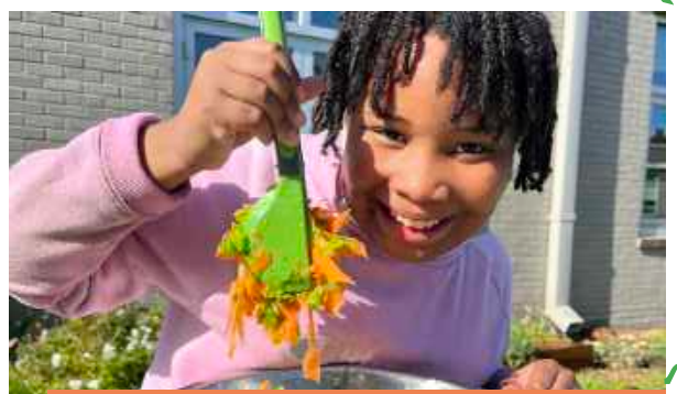
SCHOOL CAFETERIA TASTE-TESTS

"I enjoyed the taste tests. Because I enjoy trying new things and it was new every time." - 6th grade Green Heart student