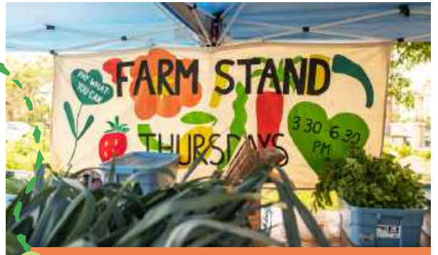
WEEKLY PRODUCE MARKET

Restaurant sales help to earn income to support farm operations, while raising awareness of our work in the community and connecting with local businesses.