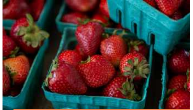
HOME WITH STUDENTS AND FAMILIES