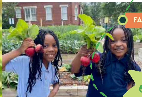
FARM TO SCHOOL LESSONS

85% of students stated that after learning how to grow fruits and vegetables, they are more likely to eat them.